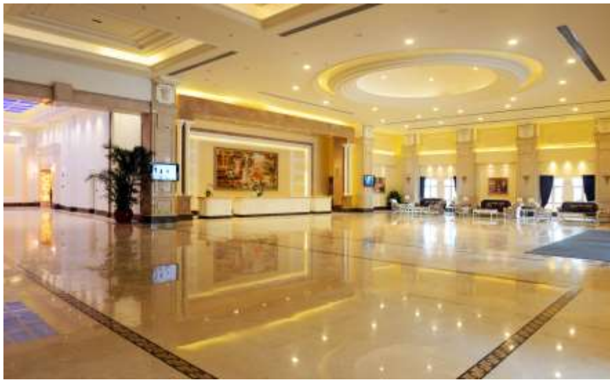
National Arts Resort Hotel – Lobby