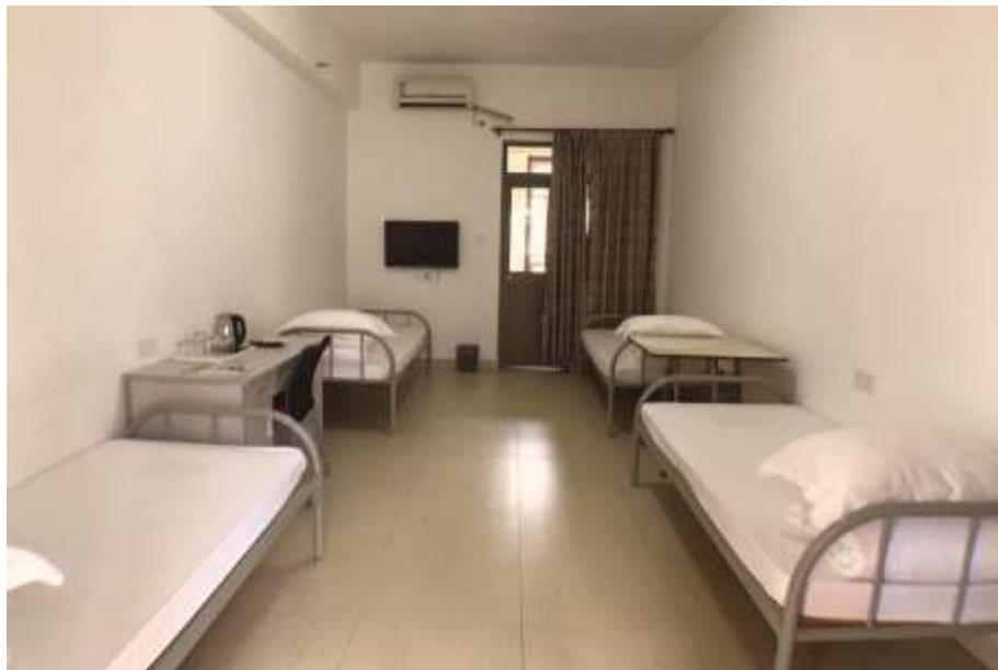
National Arts Reception Center - Guest Room