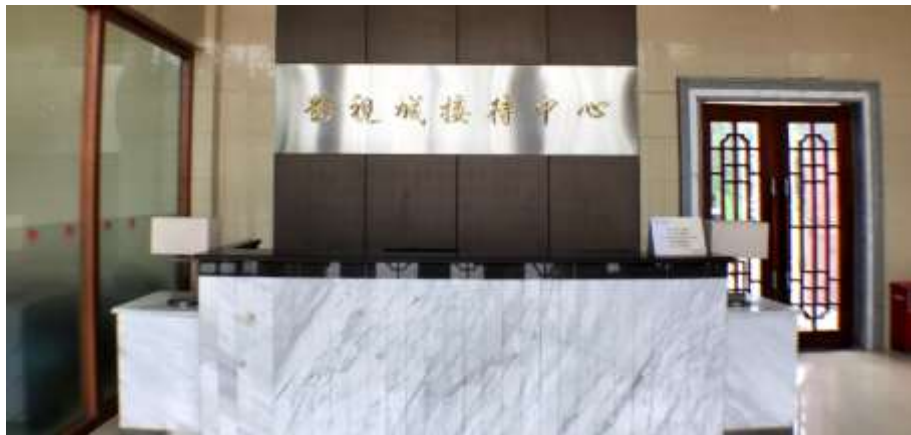
National Arts Reception Center - Lobby