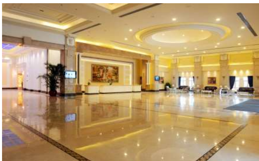
National Arts Resort Hotel - Lobby